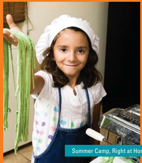
Summer Camp, Right at Home