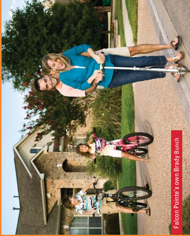
Falcon Pointe's own Brady Bunch

For more of the story, visit falcon-pointe.com .