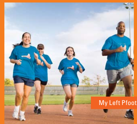
My Left Pfoot

work and play together among the homes, parks and pools of this beautifully active community.