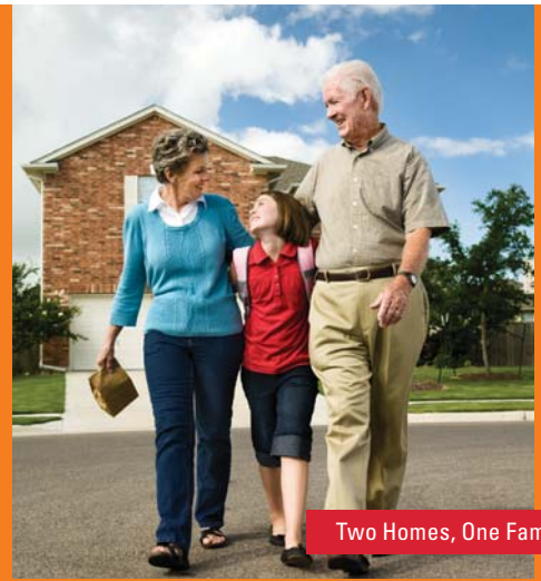
Two Homes, One Family

If the individual stories create one big family, Falcon Pointe's activities director is the perfect mom to keep it active. She creates a social life that's non-stop with sports leagues, movie nights, book clubs and even a stay-at-home parent's club among the many things on the always-full community calendar.