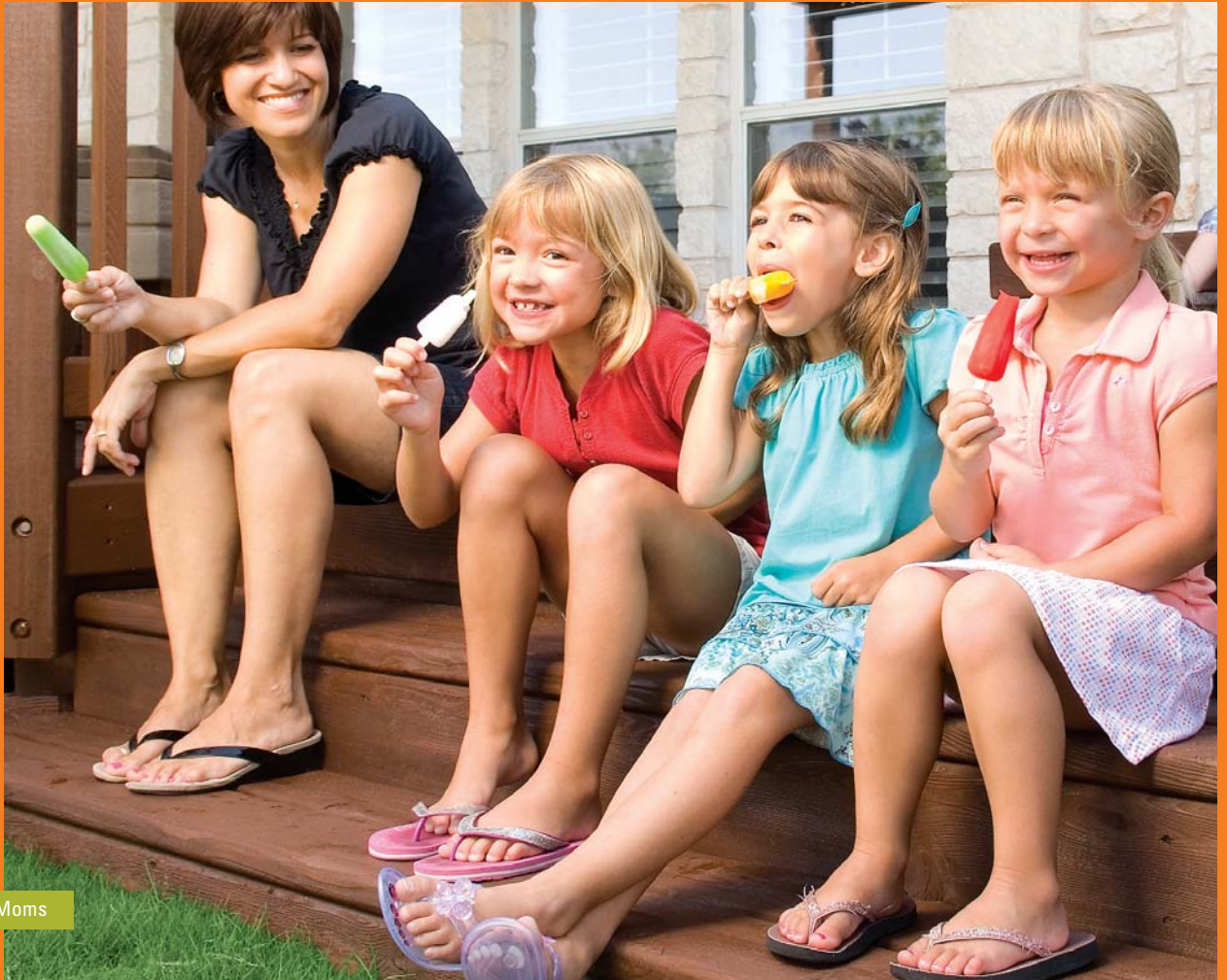
The Popsicle Moms

When you live in Falcon Pointe, you belong to something special: a real community of people with unique stories that weave together, creating a beautiful place where neighbors are friends and friends are family. Even though they may have come for different reasons, the residents of Falcon Pointe have one thing in common—they love to live, thrive,