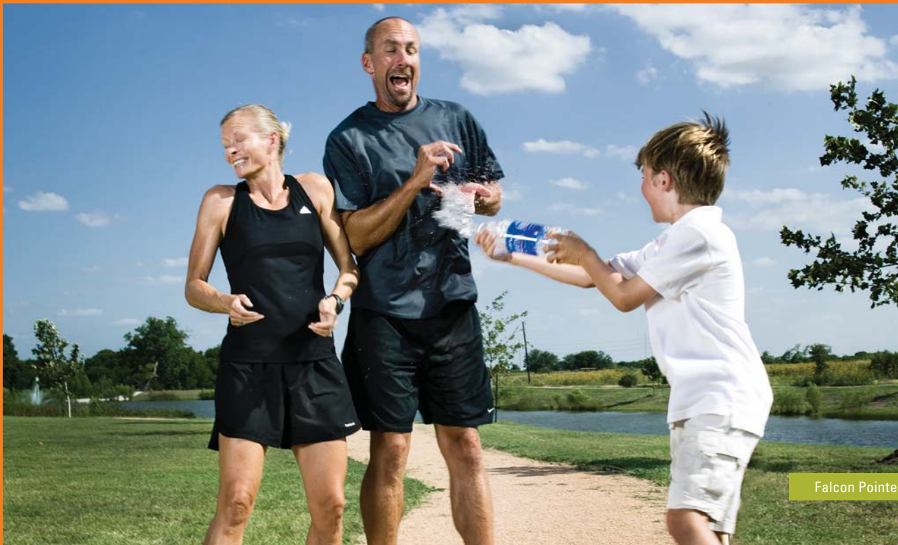
Falcon Pointe's Fittest Family